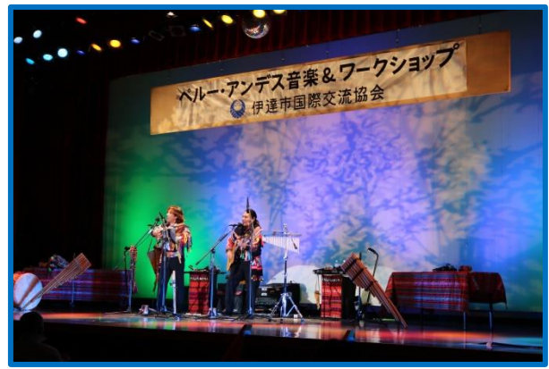
Andean Music of Peru Performance