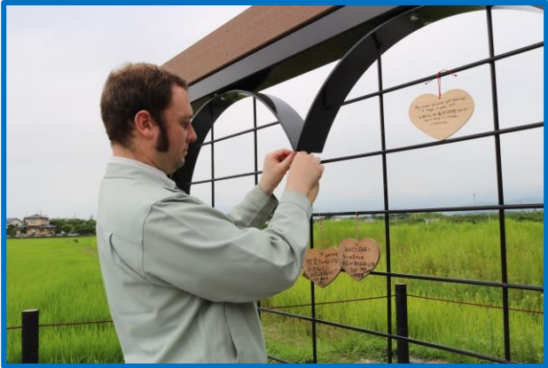
Yanagawa Town’s Heart Monument