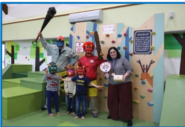
Mamemaki at Family Park