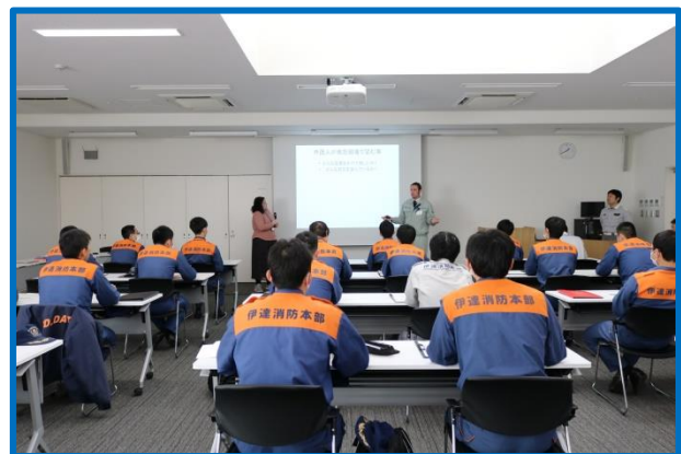
Emergency Communication Drills