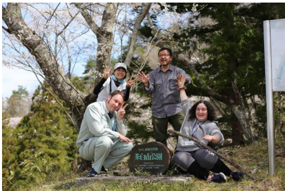
Date City Sakura Viewing