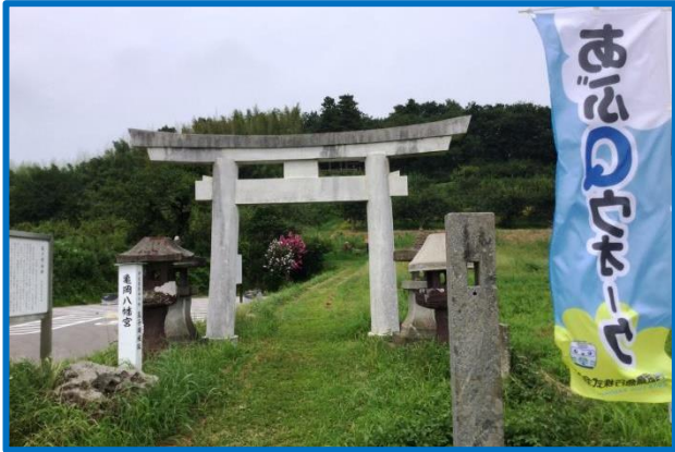
AbuQ Walk Takako