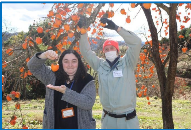
Making Dried Persimmons (Part 1)