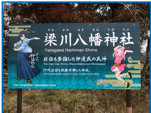
Signboard at Yanagawa Hachiman Shrine