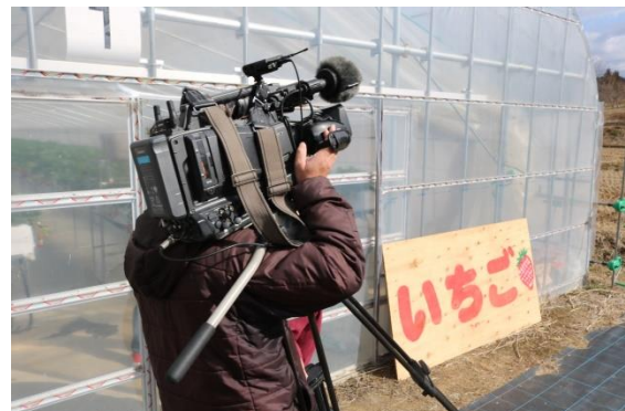
Ryōzen Strawberry Garden