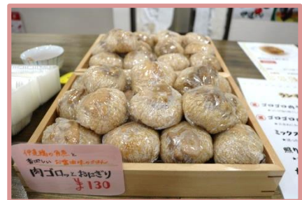
Japan's Number One Onigiri