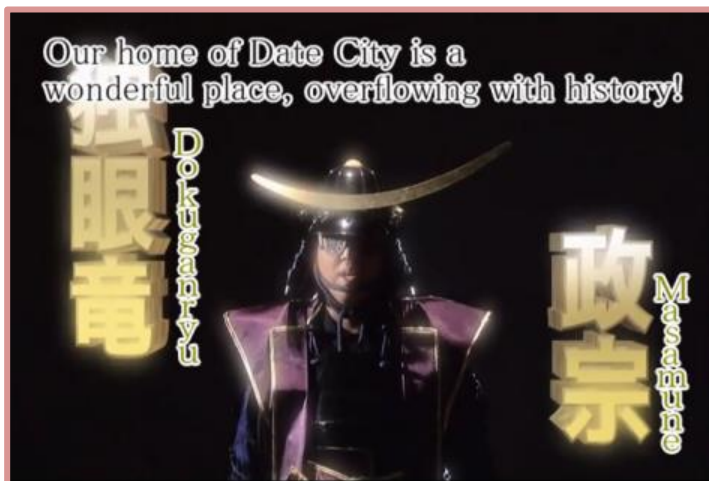
Date City's Tourism Video

Works translated : Date City's Tourism Video, Waste Disposal Guide, Mount Ryōzen Guide Map, Takako Guide Map, & Date City's Promotional Brochure