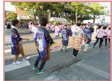
Hobara Summer Festival