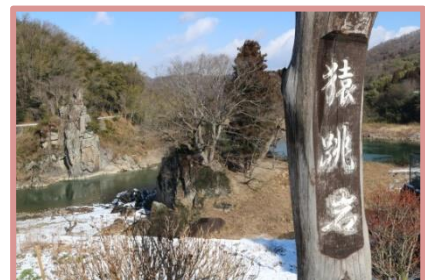
Bouncing Monkey Boulder