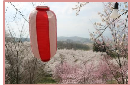
Flower Viewing in Date City