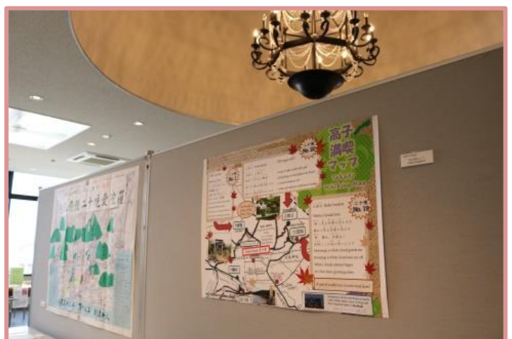
Takako Guide Map on display at the Yanagawa Art Museum