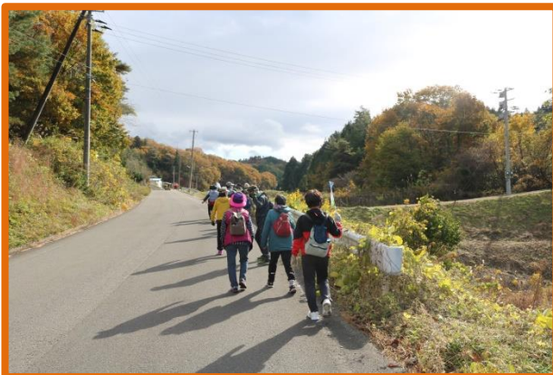
A Lively Walk in Ryōzen