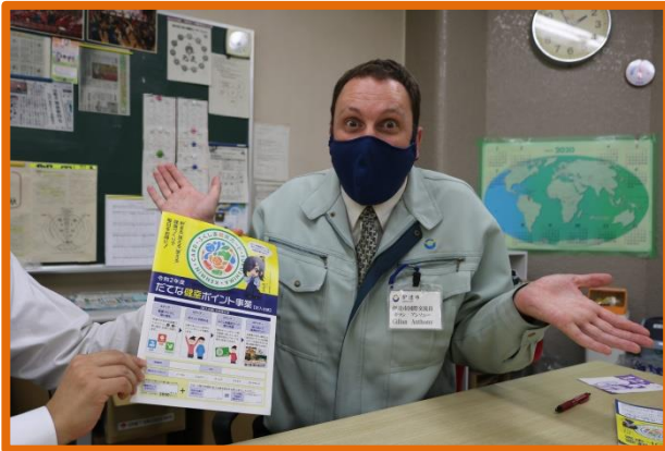
Healthy and Happy Date Point Program