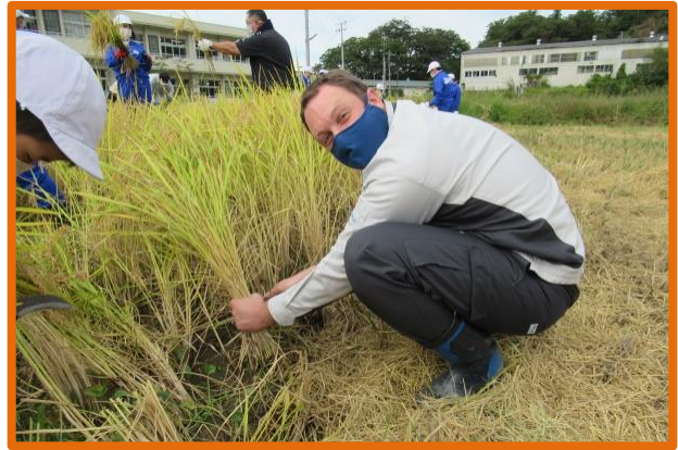
Harvesting Rice at Tsukidate Academy