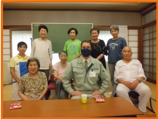
Senior Tea Party in Tsukidate