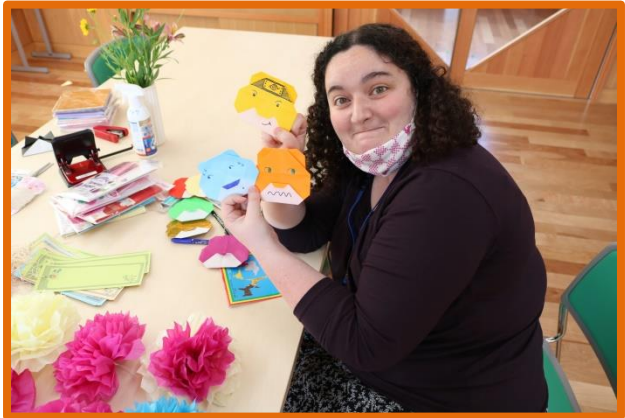
A Day at Tsukidate Academy